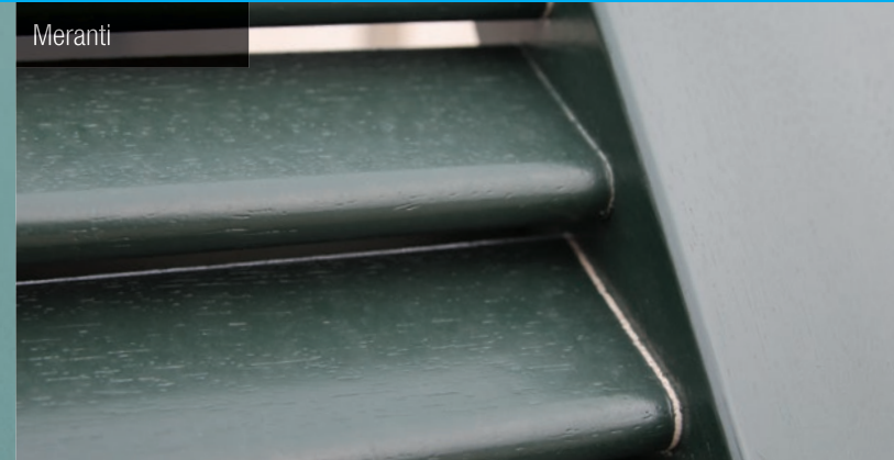
Decking (detail): 4 years outdoors. Matt system.